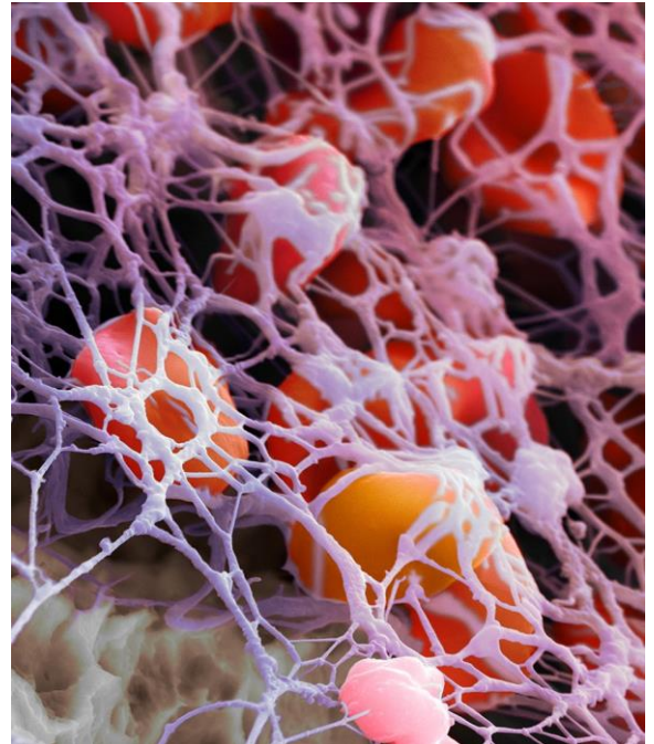
MICROSCOPIC VIEW OF A WHOLE BLOOD CLOT

The ActiGraft System is intended to be used at point-of-care for the safe and rapid preparation of a whole blood clot tissue from a small sample of a patient’s own peripheral blood. Under supervision of a healthcare professional, the Autologous Whole Blood Matrix produced by the ActiGraft System is topically applied for the management of exuding cutaneous wounds, such as leg ulcers, pressure ulcers, diabetic ulcers, and mechanically or surgically debrided wounds.