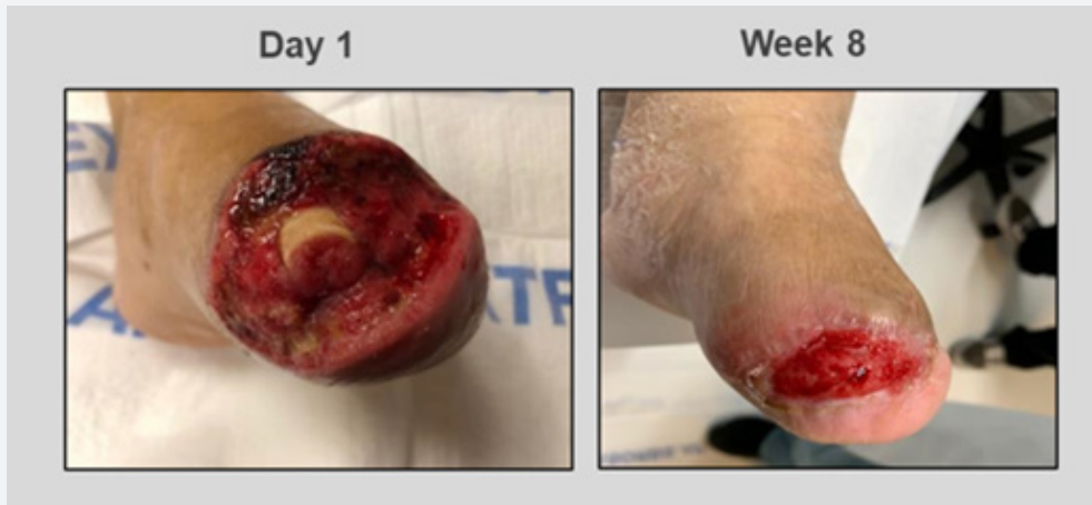
Figure 1: Failed TMA wound with exposed bone and tendon was treated with 1 ActiGraft application. 80% wound reduction on week 8 was observed.

exhibiting massive granulation over the bone. A standard of care treatment was applied thereafter. On week 8, the wound showed an area reduction of 80%. The minimally exposed wound bed was consistent with healthy granulation tissue with ingrowth of soft tissue layers leading to coverage of vital structures such as the previously exposed bone. Wound healing had occurred, allowing for the growth of healthy skin to take place (Figure 1).