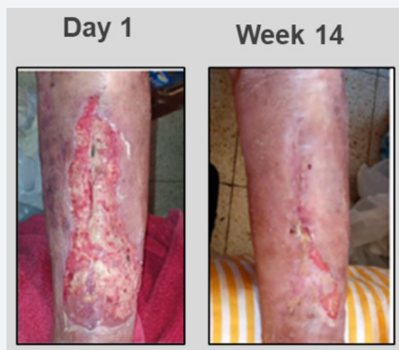
Figure 2: A 1-month-old venous ulcer, was treated with 4 ActiGraft applications for 14 weeks to achieve complete wound closure.

irregular with a violaceous periwound environment. The wound bed consisted of a 90/10 mix of fibrotic nonviable tissue with minimal granulation. Although the patient exhibited symptoms of venous insufficiency, treatments failed to improve the lesions and her wounds continued to worsen. Local wound management with a silver-impregnated foam dressing and selective debridement failed to garner improvement. However, once the wound failed to demonstrate signs of progress, ActiGraft was introduced to the wound resulting in complete healing after 14 weeks with only 4 applications (Figure 2).