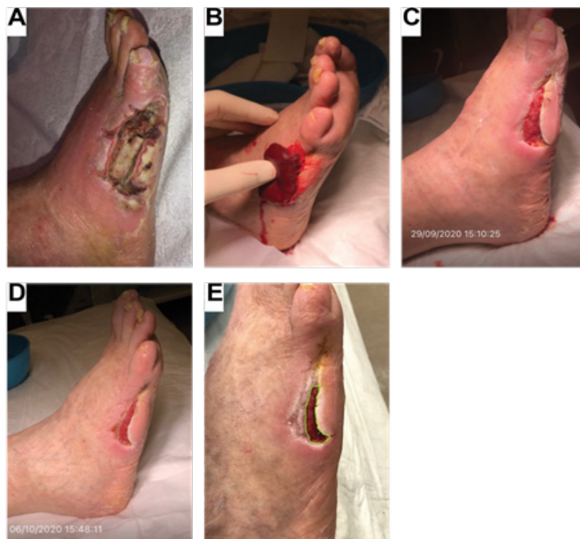
Figure 3: Case study 3: 76-year-old male with a past medical history of peripheral arterial disease and gangrenous ulcer. (A) Chronic gangrenous ulcer measuring approximately 15 cm 2 with a fibronectic wound bed and ischemic changes noted to the 5th digit. Cellulitis changes were noted to the foot and undermining and tunneling of the ulcerative site. (B) Application of ActiGraft onto the ulcerative site. (C) Following one week, there was improvement of the ulcerative site with a reduction of wound bed size to approximately 5 x 2 cm. There was a decreased fibronectic wound bed with increased granulation to the ulcerative site and re-epithelialization of the peri-wound area/edges. There was no tunneling and a reduction in undermining. (D) Following the second treatment, there was continued healing of the ulcerative site, which measured approximately 4 x 1.7 cm. Reduced undermining noted with continued re-epithelialization of the surrounding wound edges was observed. (E) During follow-up, there was increased re-epithelialization of the peri-wound area with continuous granulation of the wound site. The ulcerative site measured approximately 2.9 x 1.1 cm.