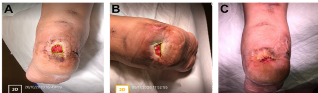
Figure 1: Case study 1: 50-year-old female with a past medical history of deep vein thrombosis and lymphedema (A) Prior to the application of ActiGraft, the right heel ulcer measured approximately 2.2 cm 2 consisted of a granular wound bed with islands of fibrotic tissue, peri-wound maceration, undermining, epibole formation, and skin induration. (B) Two weeks after ActiGraft application, the ulcer was reduced to approximately 1.3 cm 2 . An increase in granulation tissue and a decrease in maceration was noted. Evidence of re-epithelialization and further coalescence of wound edges was present. (C) At this time, it was determined that continued standard of care treatment was sufficient for complete wound healing.

Prior to ActiGraft application, all wounds underwent complete debridement of the wound tissue, bacterial balance, and moisture balance. To clear necrotic tissue, debridement was performed using surgical enzymatic, autolytic, or mechanical methods. For the ActiGraft blood clot formation, 15 mL venous blood was drawn into sterile Acid Citrate Dextrose adenine (ACDA) vacuum tubes and activated ex vivo using calcium gluconate and kaolin. Following the procedure, the blood was