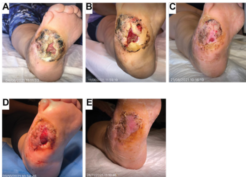
Figure 4: Case study 4: 40-year-old female with a past medical history of meningocele and Charcot neuroarthropathy (A) Ulcer measured approximately 2.8 cm 2 exhibiting a fibrogranular wound bed, limited to the subcutaneous layer. A large peri-wound hyperkeratotic rim with necrotic areas was present. Undermining and epibole were noted in the ulcerative lesion. (B) One week after the first treatment, there was a decrease in fibrotic tissue to the wound bed and in peri-wound hyperkeratotic rim necrosis. Initiation of granulation of the wound bed causing contraction of the wound edges and reduction of the epibole was observed. (C) After the second treatment, there was significant granulation and re-epithelialization of the wound bed, with the ulcer measuring approximately 1 cm 2 . There was the complete eradication of the epibole and continued decrease of necrosis to the hyperkeratotic rim. (D) After the tenth treatment and a two-month pause of treatment, there was a decrease in the peri-wound hyperkeratotic rim and an increase in wound size from approximately 1 cm 2 to approximately 3 cm 2 . The ulcer consisted of a granular wound bed with no undermining or epibole present. (E) After the 14th application, complete wound healing and coalescence of wound edges were clinically observed. Adequate re-epithelialization of the wound bed was noted with minimal hyperkeratotic wound edges.

cation, there was a decrease in fibrotic tissue and necrosis, noted in the peri-wound hyperkeratotic rim, and initiation of granulation of the wound bed, causing contraction of the wound edges (Figure 4B). The ulcer was treated weekly with ActiGraft and exhibited a decrease in wound size, granulation of the soft tissue deficit, and a reduction of necrotic tissue. On week 10, there was significant granulation and re-epithelialization of the wound bed, and the ulcer measured approximately 1 cm 2 . A continued decrease of necrosis in the hyperkeratotic rim was observed (Figure 4C). Following the tenth application, the treatment was paused for two months due to the patient's travels, which resulted in an increase in wound size; however, the decrease in the peri-wound hyperkeratotic rim continued throughout this time (Figure 4D). The ulcer consisted of a granular wound bed with no undermining. An additional four applications were performed, for a total of 14 applications. During the final treatment, complete wound healing and coalescence of wound edges were clinically observed (Figure 4E). Adequate re-epithelialization of the wound bed was present with minimal hyperkeratotic wound edges.